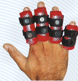
Finger Gutter Splint